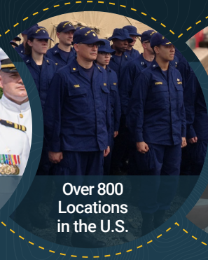
Over 800 Locations in the U.S.