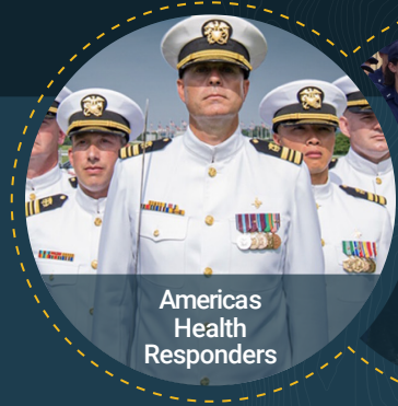
Americas Health Responders

The USPHS Commissioned Corps is one of the eight uniformed services and is composed of over 6,000 full-time public health professionals.